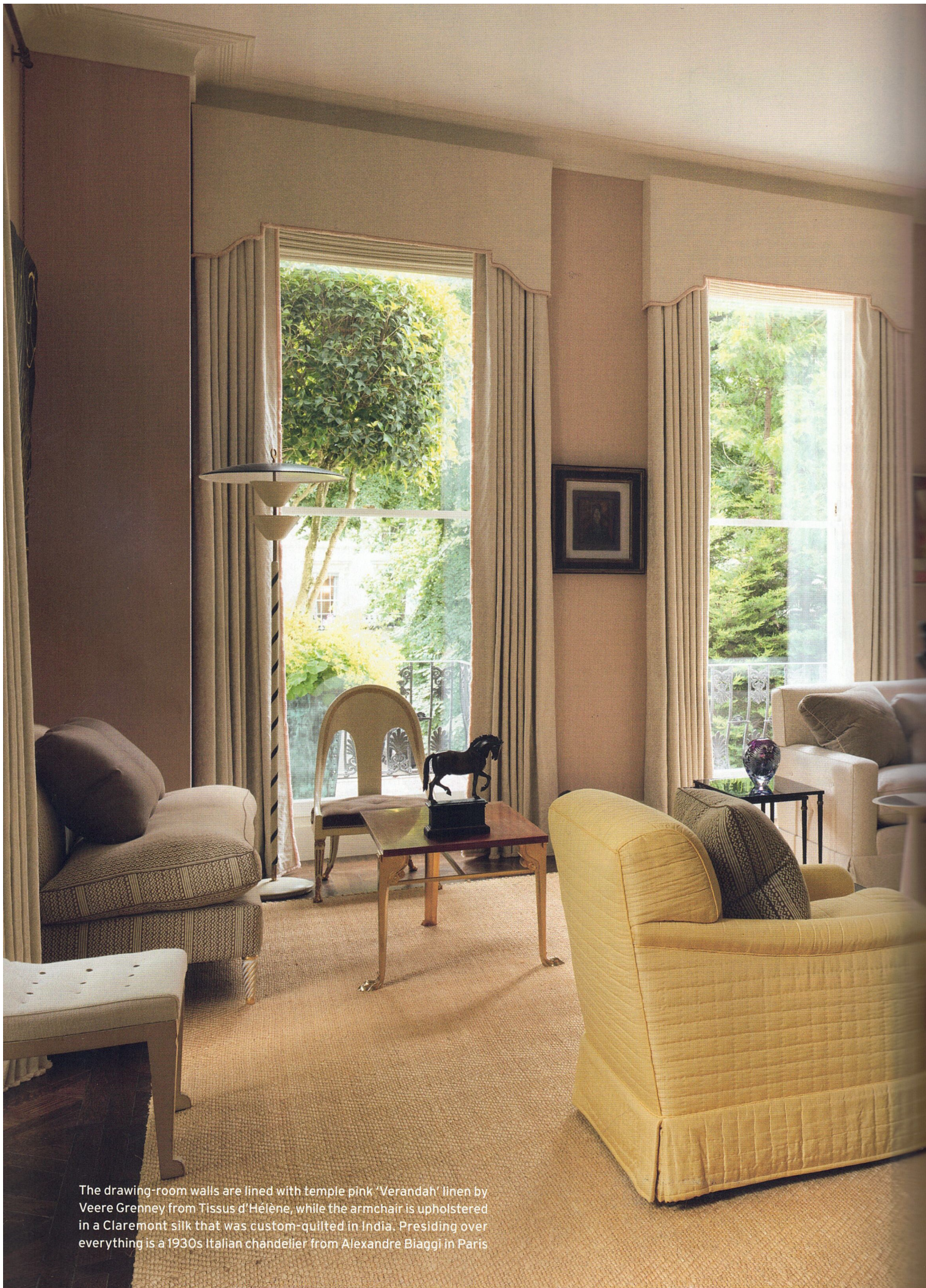
The drawing-room walls are lined with temple pink 'Verandah' linen by Veere Grenney from Tissus d'Hélène, while the armchair is upholstered in a Claremont silk that was custom-quilted in India. Presiding over everything is a 1930s Italian chandelier from Alexandre Biaggi in Paris