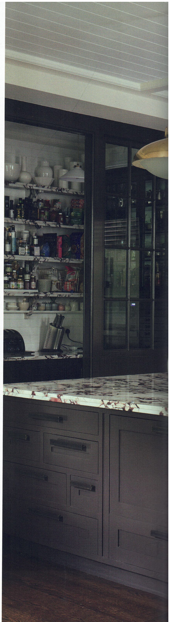
From top: the kitchen windows are dressed with curtains and box pelmets in a Claremont fabric, 'Hindu'; a set of original Arne Jacobsen dining chairs sit on a Sinclair Till rug. Visible on the right is the glazed pantry