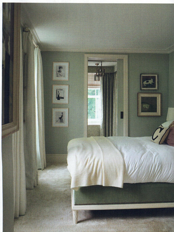
This page, clockwise from top: in the boy's bedroom, walls upholstered with chocolate-coloured alpaca provide the backdrop for a pair of 1940s walnut bedside tables, topped with glazed lamps from Tarquin Bilgen, and a French desk of similar vintage; glazed linen lines the girl's room, which is furnished with a bespoke bed made by Veere Grenney Associates; the interior decorator's 'Folly' linen forms window and closet curtains in the dressing room