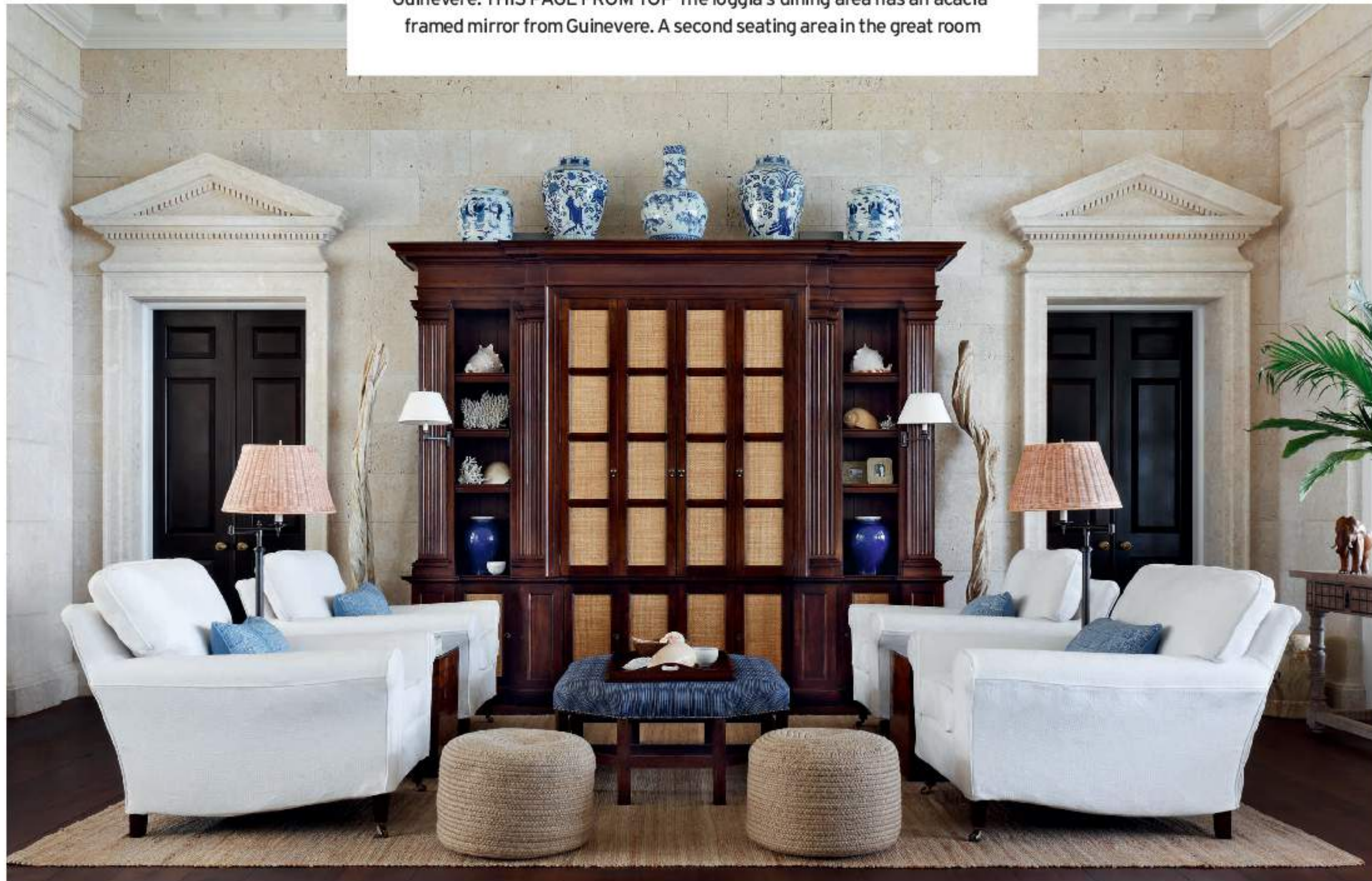
OPPOSITE At the centre of the great room, books and objets are displayed on a table from William Yeoward, sitting on a dhurrie from Guinevere. THIS PAGE FROM TOP The loggia's dining area has an acacia-framed mirror from Guinevere. A second seating area in the great room

The U-shape building creates a courtyard through which the house is entered, a little like a Palladian villa. The wings comprise bedrooms and service areas, leaving the main body of the house dedicated to places where the family can congregate. The first of these is a large loggia,