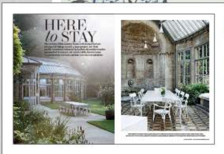
HERE TO STAY Pages 78-85