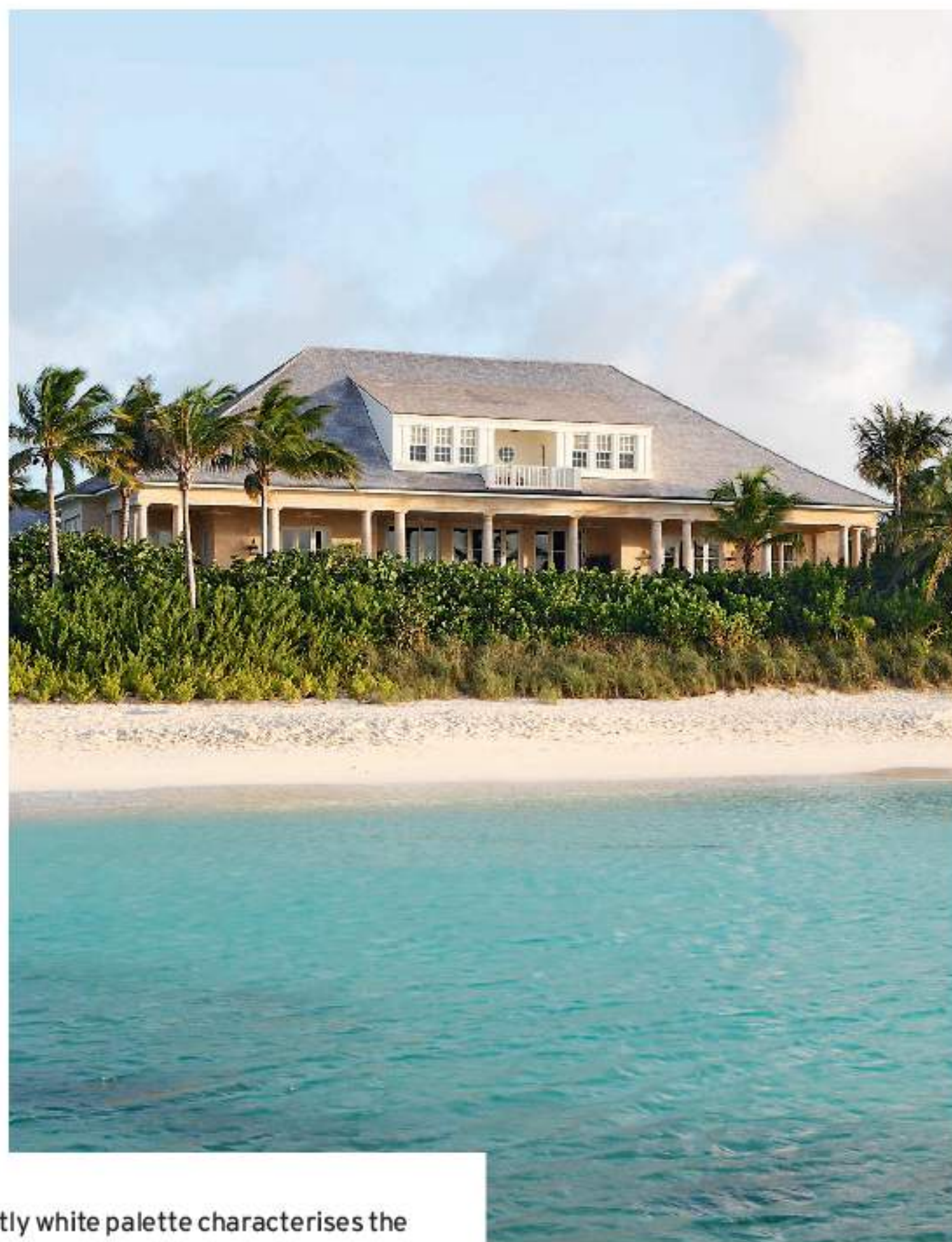
OPPOSITE ALL PICTURES A mostly white palette characterises the bedrooms, bathroom and hall, with details such as the 'Daisy' hanging light from Soane (bottom left) adding flair. THIS PAGE FROM TOP The house sits right on the beach. A pool and pool house to the side of the main house

John McCall: 01635-578007; mccalldesign.co.uk