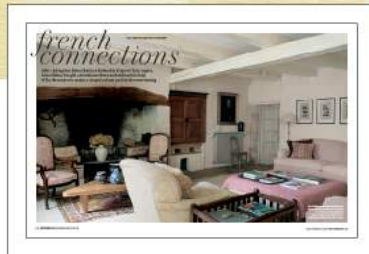
FRENCH CONNECTIONS Pages 86-93