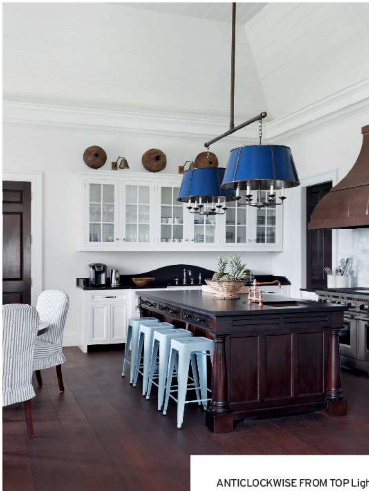
ANTICLOCKWISE FROM TOP Lights from Charles Edwards hang over the island in the kitchen, which leads into the television room (bottom left). Rattan chairs from Century Furniture on the rear terrace. OPPOSITE The cypress-panelled library walls are decorated with maps of the Caribbean